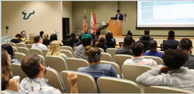
The Johnson Lab's inaugural SMART START Symposium at USF, 2022

The SMART goal is to increase the number of highly skilled URM scholars who enter graduate degree programs focused on careers in substance misuse