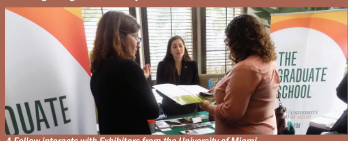
Fellow interacts with Exhibitors from the University of Miami.