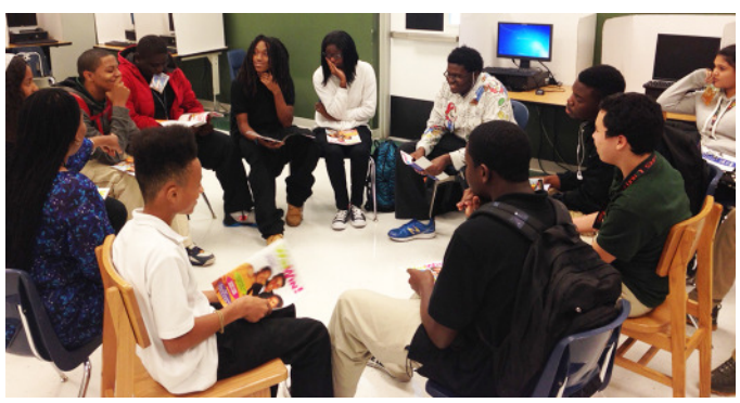
Students at Miami Central High engage in a Life Skills rap session.

Each afternoon, CodeMasters students at Carrie P. Meek/ Westview K-8 Center, North Dade Middle School, Carol City High School and Central High School in Miami-Dade begin their afternoons with a nutritious snack before completing homework and receiving virtual tutoring as needed from volunteer McKnight Doctoral Fellows.