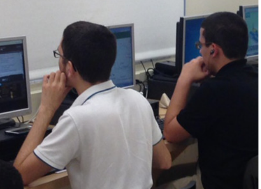
Students code at North Dade Middle School, left, and at Carol City High School, right.

In the summer, the program will continue with intensive six-week camps where students will work to improve academic performance while immersing themselves in code. In the middle school camps, students will learn to build and program robots, and in the high school programs, they will focus on game design.